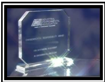
Presentation of 2011 Environmental Excellence Awards